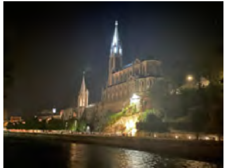
LOURDES AT NIGHT, TAKEN BY ONE OF THE VOLUNTEERS WHO WENT ON HER 1ST TIME TO LOURDES WITH THE DUBLIN DIOCESE PILGRIMAGE TO LOURDES.